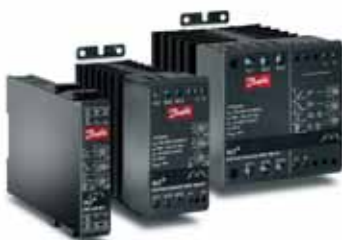
VLT® Soft Start Controller MCD 100