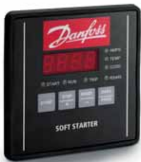
IP 54/NEMA 12