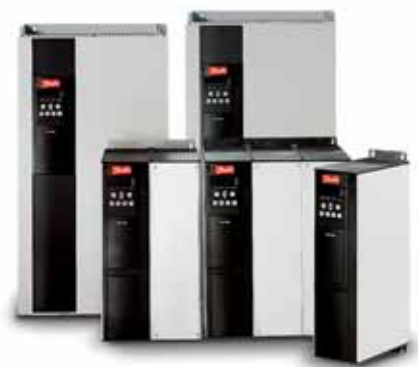
VLT® Soft Starter MCD 3000