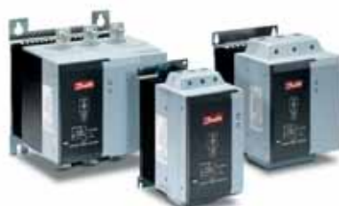
VLT® Compact Starter MCD 200